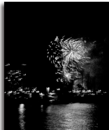
HM "Fireworks Over the Bay" Jared Ikeda