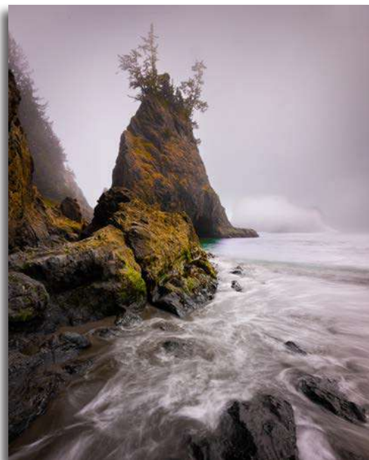
2 nd "Secret Beach" Bill Brown