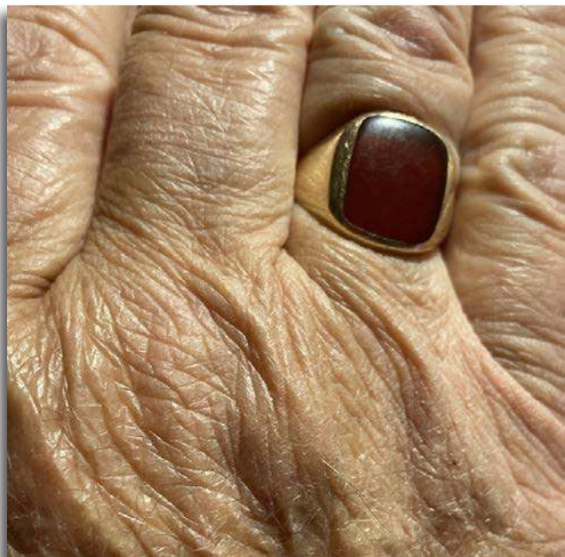
HM "Wrinkles" Brooks Leffler