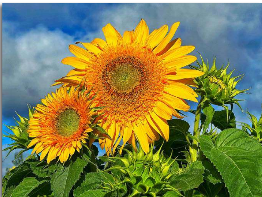
1 st "Sunflowers" Bill Shewchuk