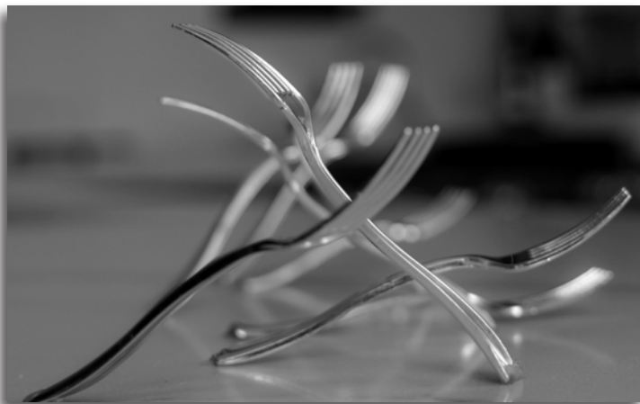
HM "Defying Gravity" Carole Gan